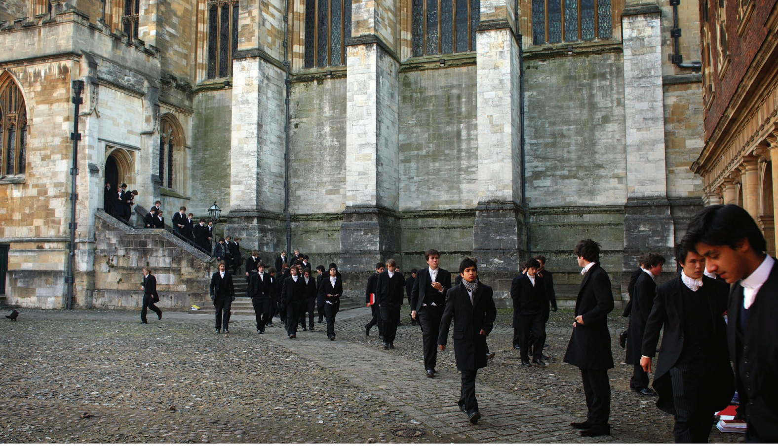
In science, like many other professions, better-off individuals and those educated at elite institutions such as Eton College, UK, are often over-represented.