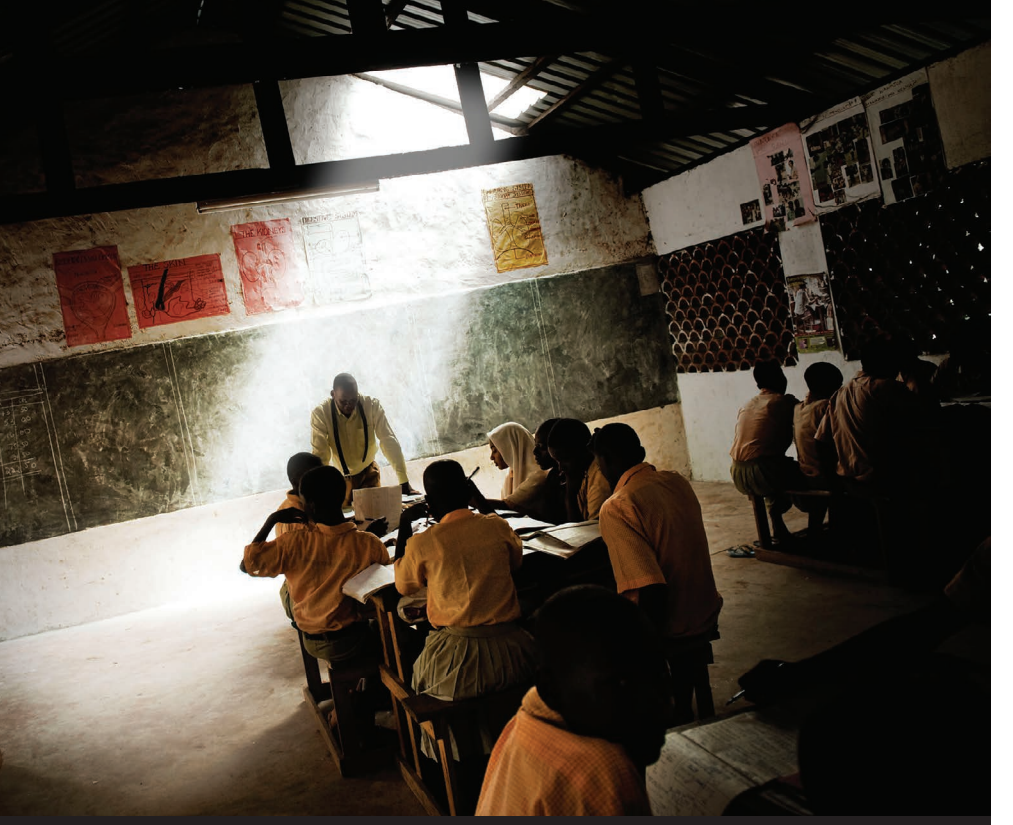
Poor students from Kenya are often interested in science, but struggle to make it a career.