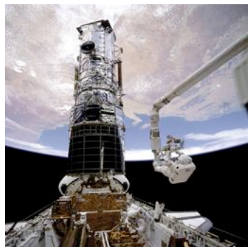
Servicing missions have kept Hubble at the cutting edge of science.

Immediately there was a problem. The mirror was the wrong shape at the edges, which made Hubble's first images blurry. O'Dell insists that the pictures were still better than ground-based observations, but because of the 'halo' of blurriness, only the middle 20% of an image was tightly focused. Algorithms were produced to compensate for this but another problem was the unexpected shaking of the telescope due to solar winds as it went from sunlight to darkness on each orbit. Hubble detractors and the press were quick to claim that the instrument was a "techno turkey," says O'Dell.