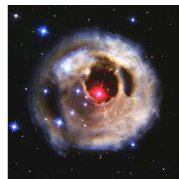
See Nature's Hubble anniversary slideshow for more stunning images.